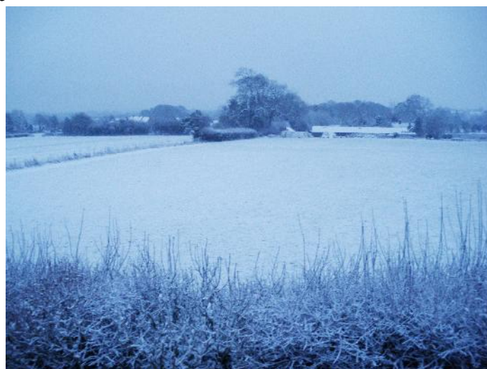
A reminder of the snow that fell on Elkstone in December 2011