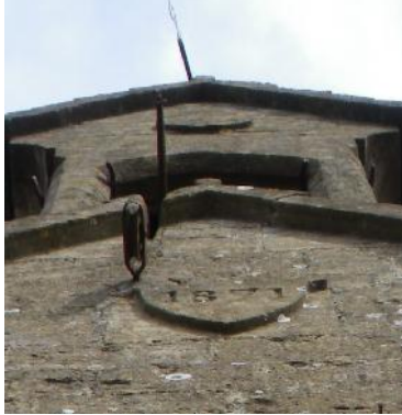
Gable end of Village Hall Yes, a gas pipe warning sign, but where is it?