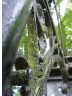
Looking up the lamp-post by the church